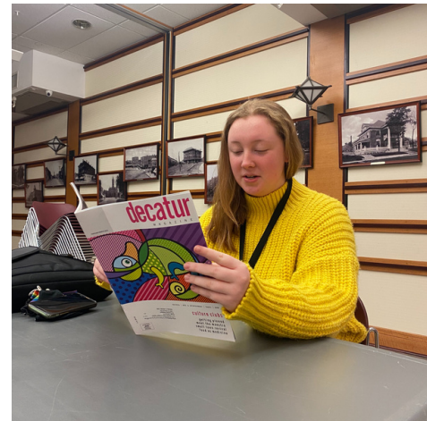
The CICEO Class was featured in Decatur Magazine!